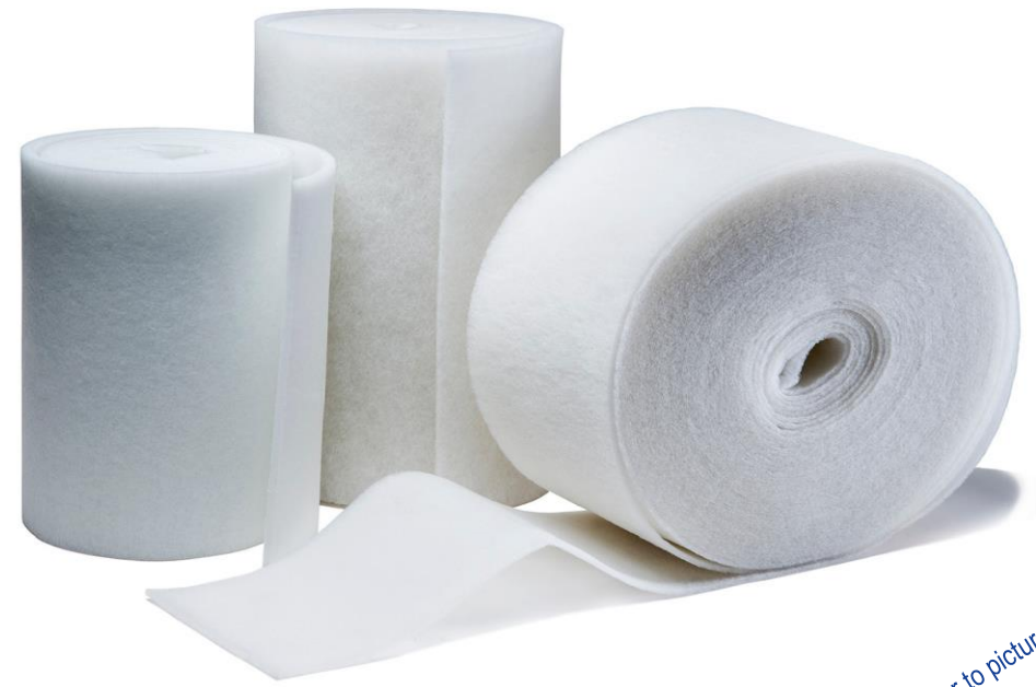
Similar to picture