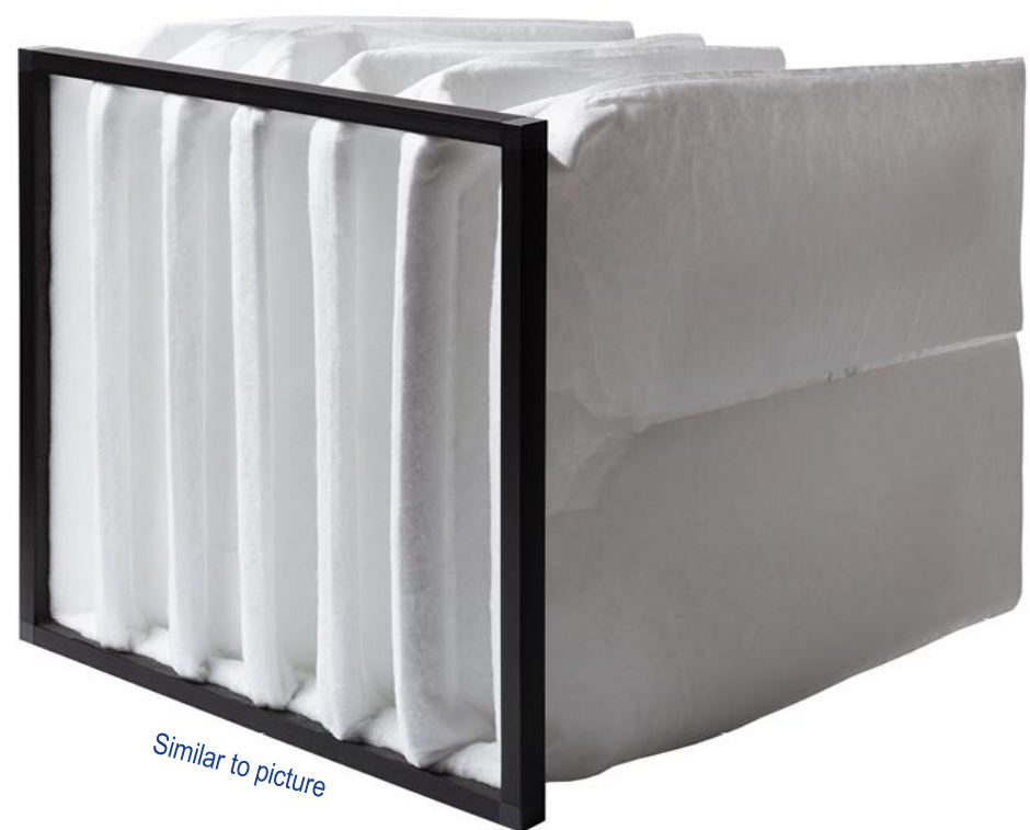
Similar to picture