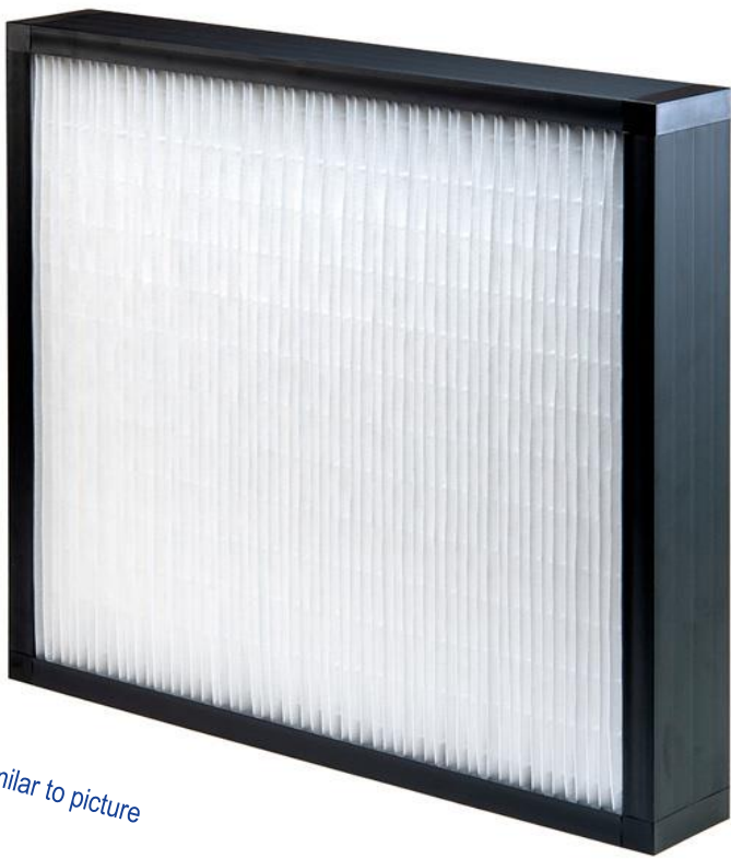
Similar to picture

Notice: All information and illustrations are sole property of Volz and are provided to the best of our company's knowledge. Yet our company does not take over any warranty for the completeness and/ or correctness and cannot be held liable for any damage occurring to the recipient through the use or through her or his trust in the completeness and/ or correctness of the information. The given data are mean values with tolerances due to normal production variations and do not release the recipient from own checks, investigations and test. Furthermore, all data serve as service description and shall not be interpreted as a warranty for composition or service life. Volz reserves the right to change specifications without notice.