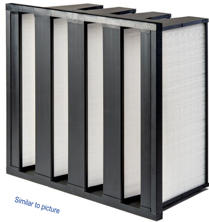
Similar to picture