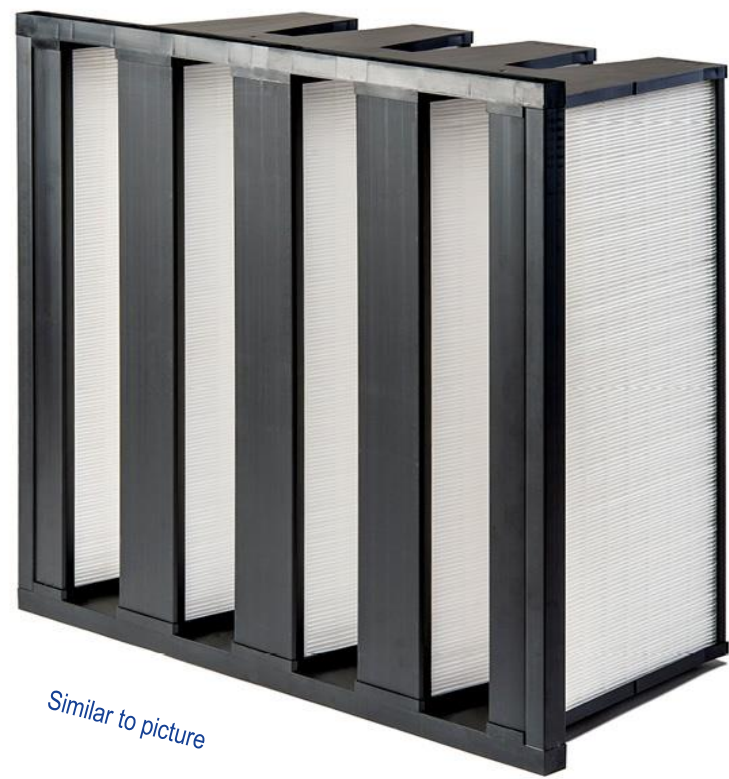
Similar to picture