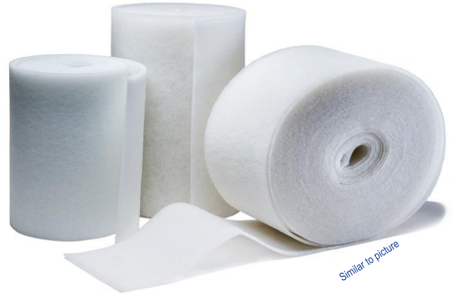
Similar to picture