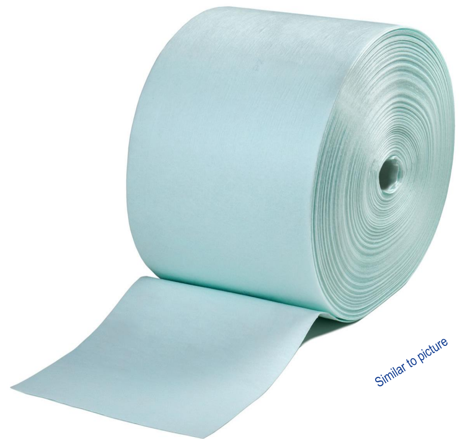
Similar to picture

Filter class and efficiency based on ISO testing of a pocket filter 592 x 592 x 600/8ET