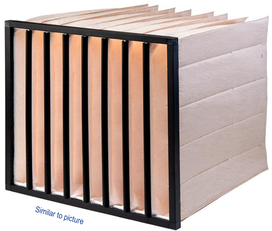
Similar to picture