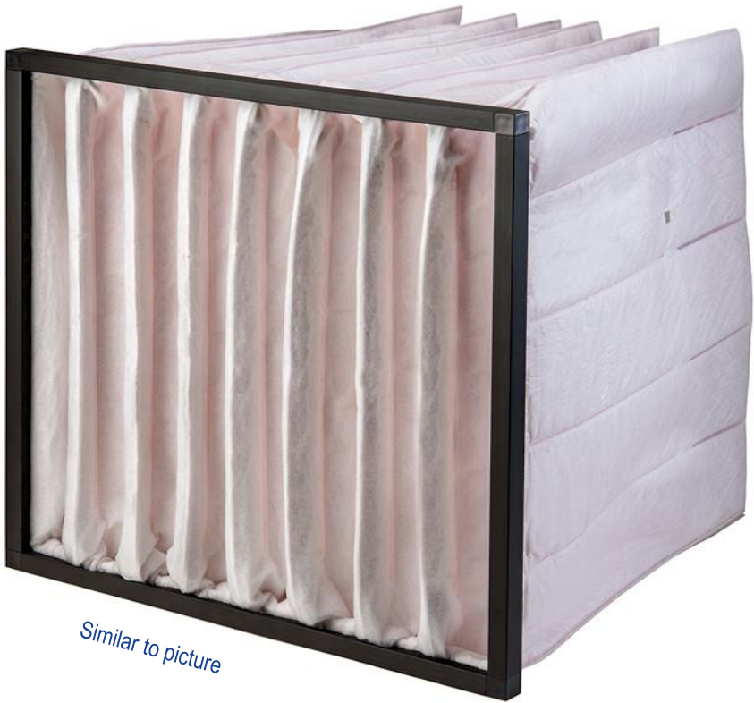
Similar to picture

Medium Synthetic-progressive microfiber Media color Pink