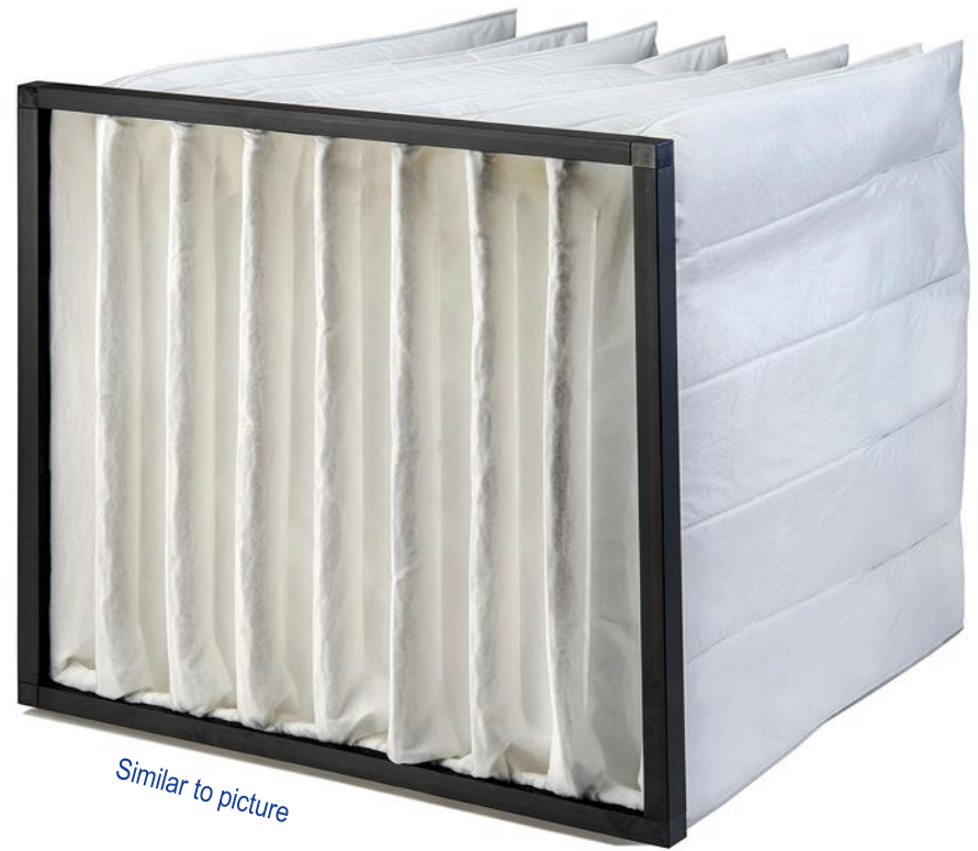
Similar to picture