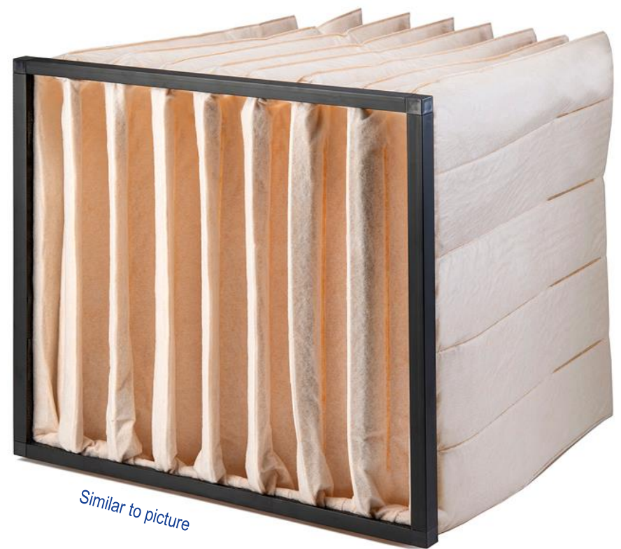
Similar to picture