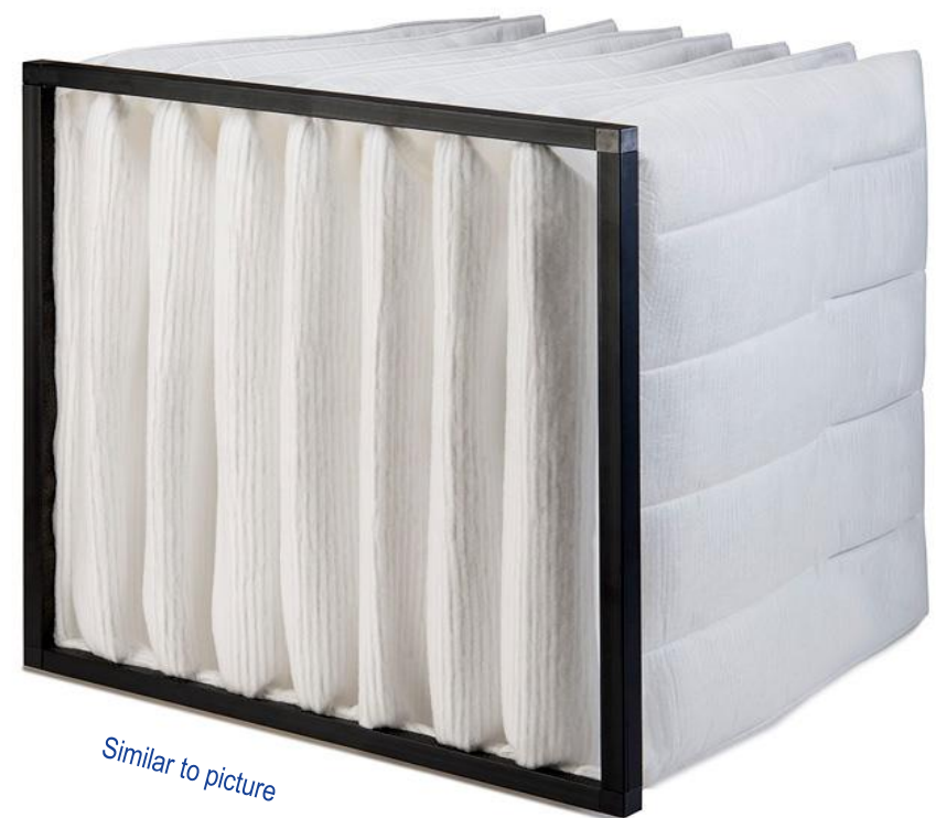
Similar to picture