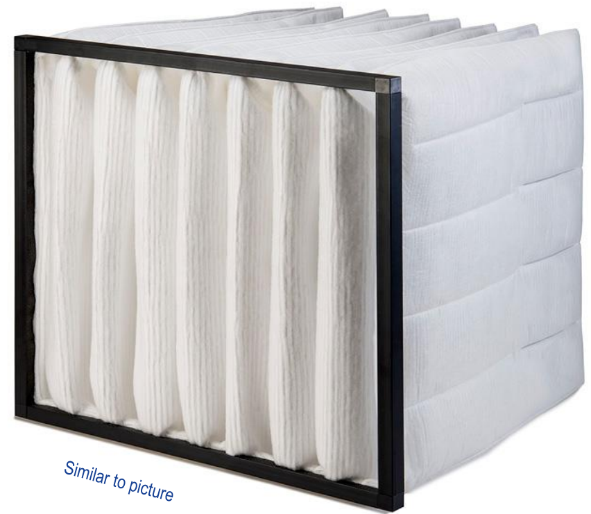
Similar to picture