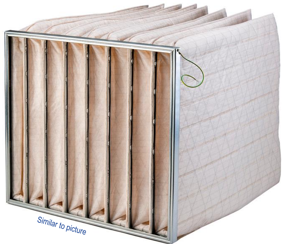
Similar to picture