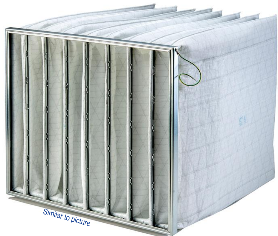
Similar to picture