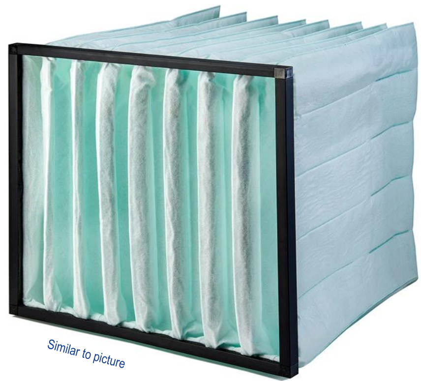
Similar to picture