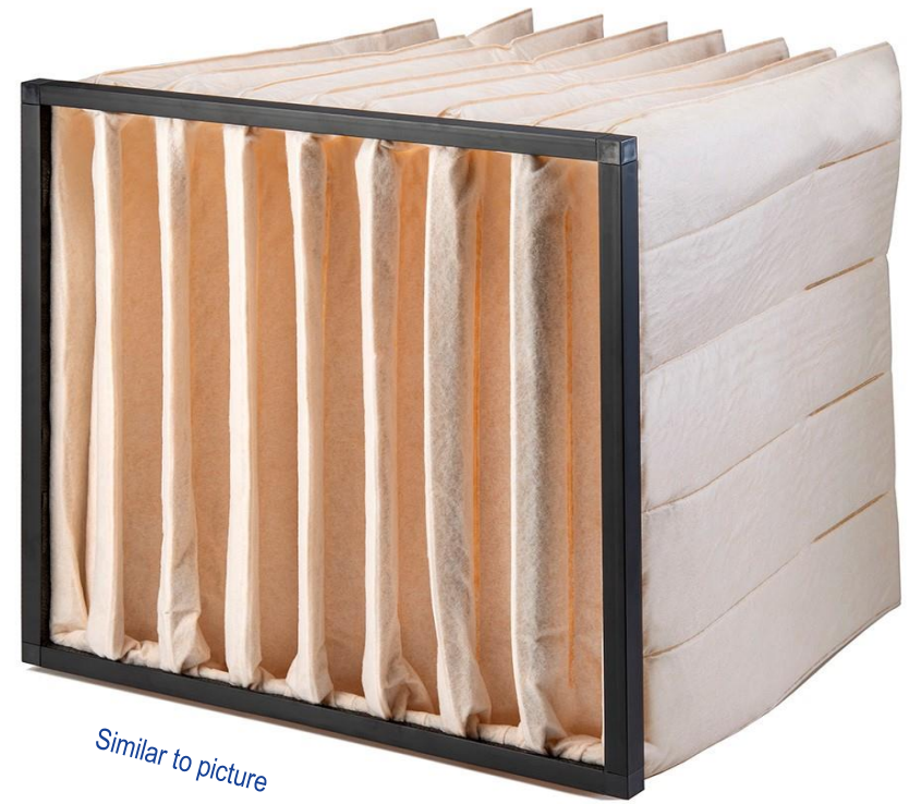
Similar to picture